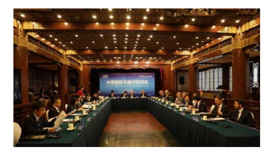
Delegates at the Australia-China Annual Think Tank Economic Dialogue, Beijing, June 18 2017